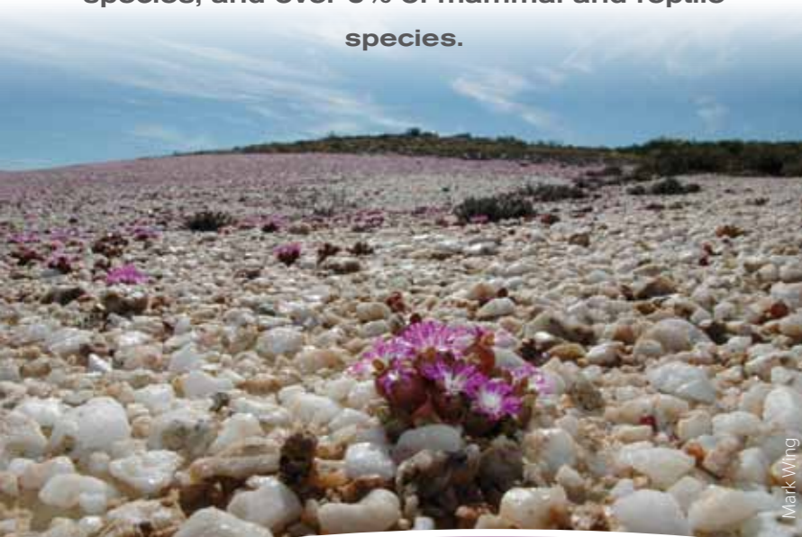
Water is essential for development in South Africa

South Africa is one of the most biodiverse countries in the world: with a land area of 1,2 million km 2 - representing just 1.24% of the Earth's surface - South Africa contains almost 10% of the world's known bird, fish and plant species, and over 6% of mammal and reptile species.