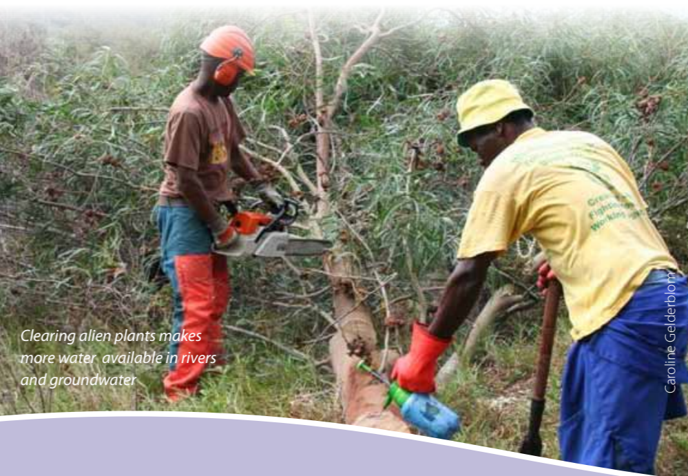
Clearing alien plants makes more water available in rivers and groundwater