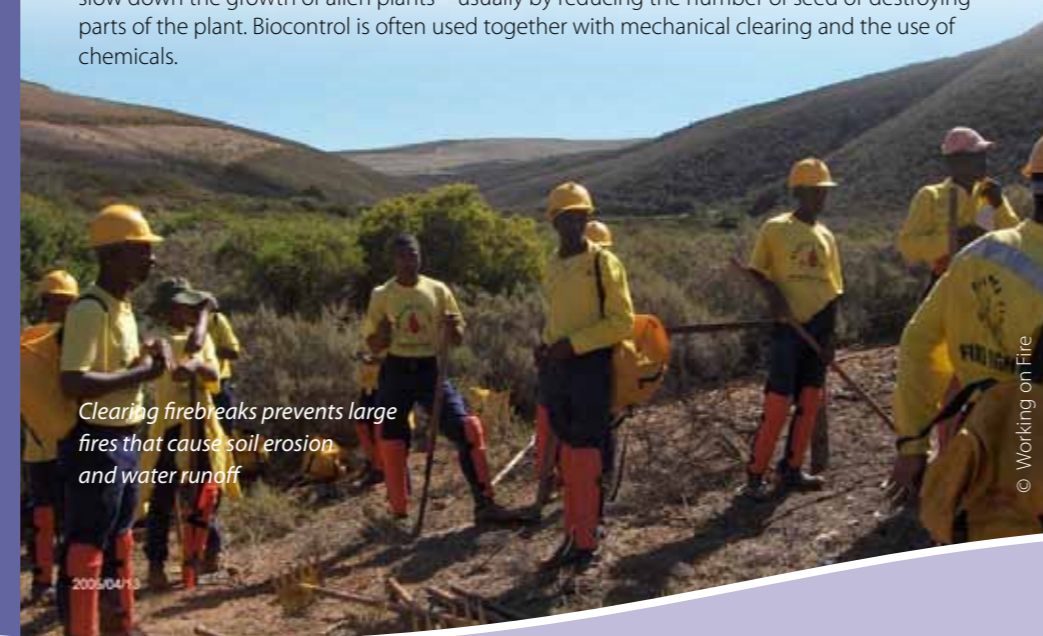
Clearing firebreaks prevents large fires that cause soil erosion and water runoff

A. Biological control or "biocontrol" is the use of living agents such as insects or fungus to slow down the growth of alien plants – usually by reducing the number of seed or destroying parts of the plant. Biocontrol is often used together with mechanical clearing and the use of chemicals.