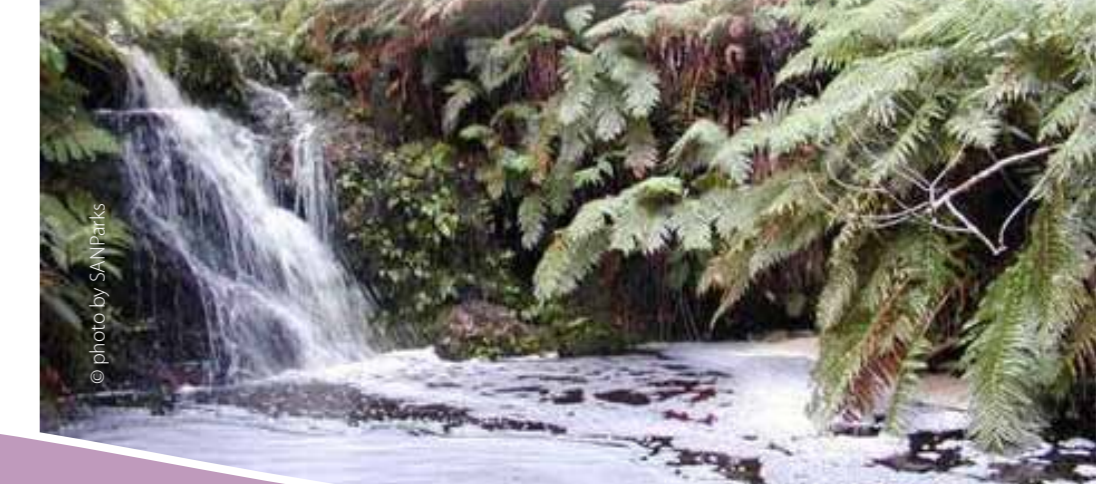
A river in the Tsitsikamma forest

If the aliens are allowed to spread unchecked in this area, they could potentially consume up to 204.19 million m 3 of water each year. By clearing these invading alien plants, the Working for Water programme is restoring ecological functioning to the park and preventing the loss of plant and animal species. Erosion of the river banks is prevented, as a stable cover of indigenous species is re-established. Thickets of a single plant are being removed, allowing the natural biodiversity to return. And removal of the excess biomass of the alien plants is allowing natural fire cycles and water regimes to resume. The Working for Water programme has also provided work opportunities and training for local people.