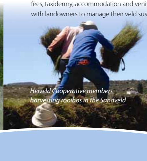
Heiveld Cooperative members harvesting rooibos in the Sandveld